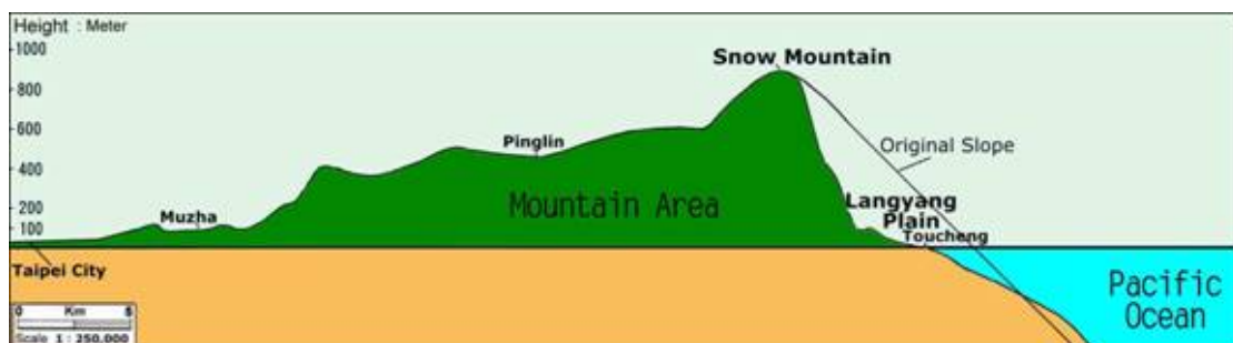
Figure 3. The profile from Taipei city to Toucheng around Pei-I Highway denotes maybe a landslide of Snow Mountain. The original eastern slope may be symmetric to the western slope.

When driving a car from Taipei City toward Ilan City through Pei-I Highway, we must climb the slope over 50 kilometers of straight distance across the western area of Snow Mountain to the ridge. When reaching the point of the ridge, we can see the whole landscape that presents Lanyang Plain just beneath our feet. Here we find a sudden drop of about 600 meters. In order to reach Lanyang Plain, we must negotiate 9 sharp bends and 18 changes of direction. The terrain features are not as symmetric as the western area of the mountain, so we may imagine that the eastern flank of the mountain has been cut out by a natural event a long time ago (Fig. 3). What is the natural event? We must understand the characteristics of northern Snow Mountain.