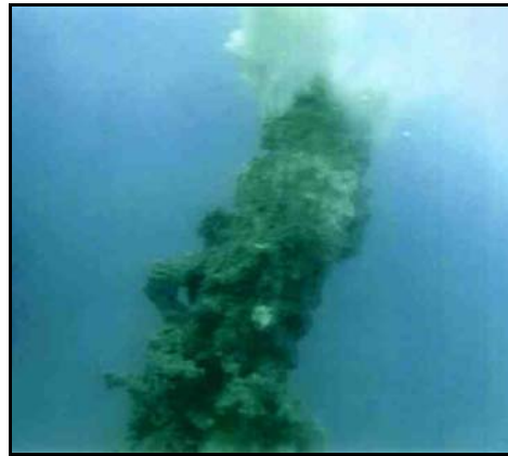
Figure 2. Near Turtle Island a nozzle of hot spring (4-m diameter and 10-m length) is the biggest in the world.

There are several hot springs that still remain today, the two most famous are: Jiaoxi Spring on the east side of Snow Mountain, and Wulai Spring on the west side. This indicates the volcanoes of northern Snow Mountain have erupted many times in the past.