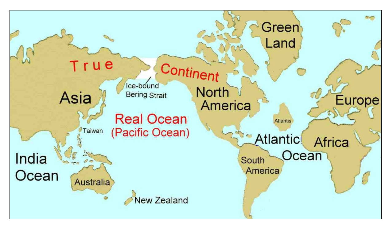
Real Ocean is the Pacific Ocean