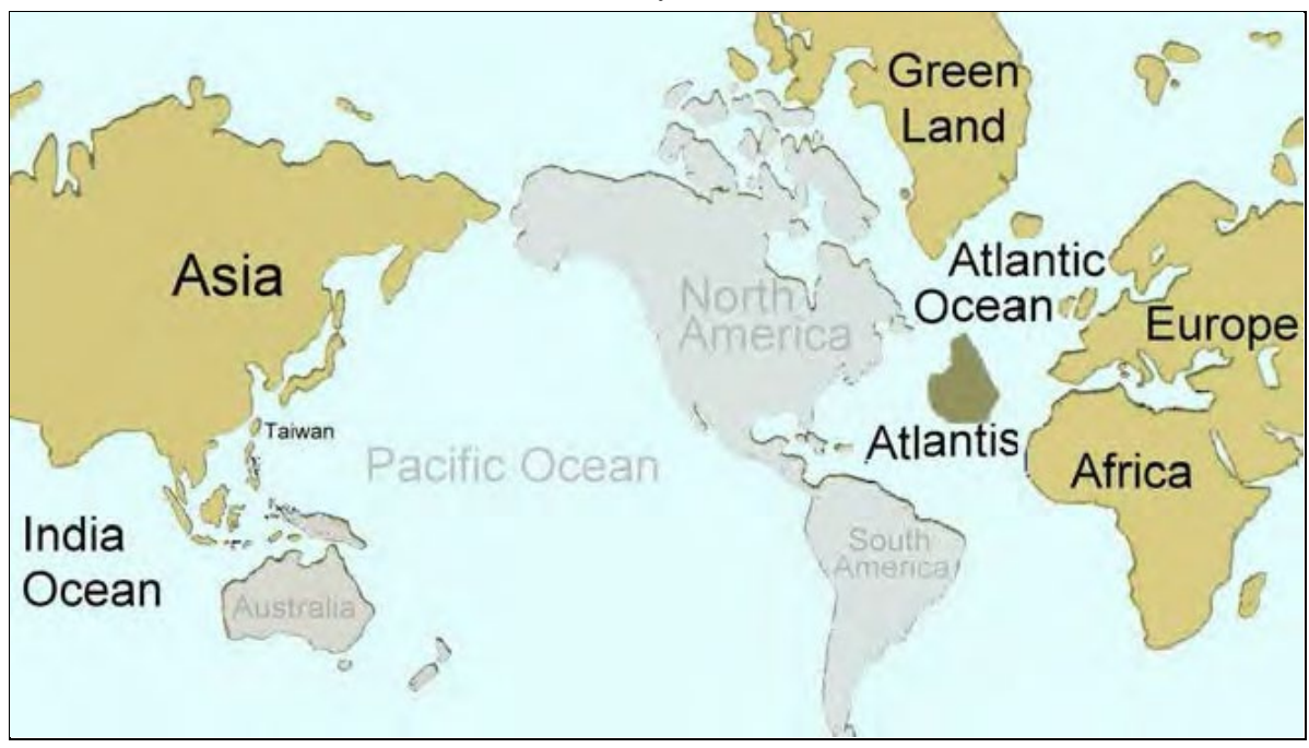
The map of Plato era

14. In the glacier period, the Strait of Bering between Eurasia and America was covered with the ice and snow, so both continents linked together into a "True Continent", just completely surrounded "Real Ocean" — the Pacific Ocean only, and there was no True Continent to surround the Atlantic Ocean. According to the clue of Solon, Real Ocean is the Pacific Ocean.