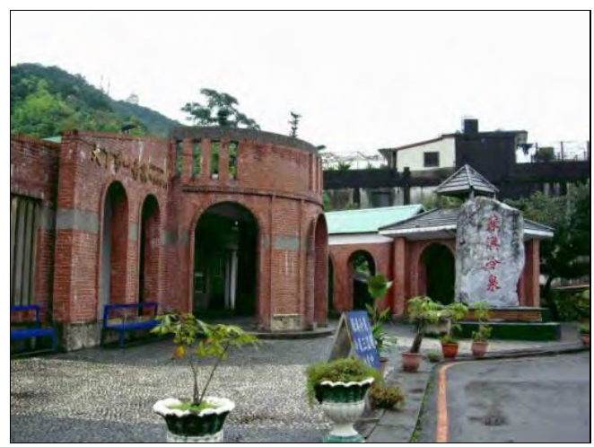
Precious cold spring at Suao.

In ancient time the Capital of Atlantis was in Ilan, where lived the earliest aborigines, should be the direct descendants of the people of Atlantis. There