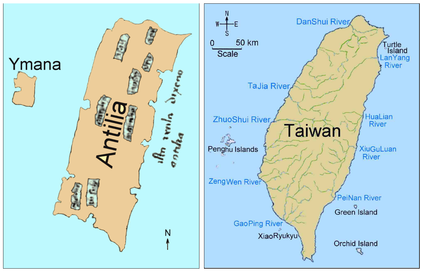
Antilia on the ancient nautical chart is similar to Taiwan Island