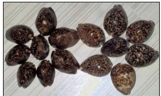
Ancient Chinese Currency — Cowry.

In Shang Dynasty, “Shell” is a character based upon the Cypraea . Meanwhile, many characters that are relative to treasure adopted “shell” as their radicals. We are sure that seashell is the currency in the ancients. The “seashell” currency system is as follows: Ten small shells were equivalent to one medium shell and ten medium shells were equivalent to one big shell.