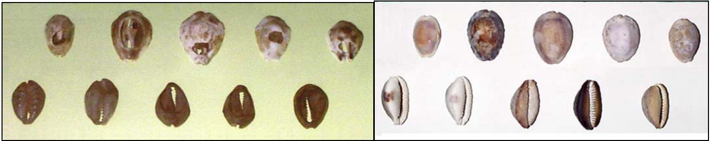
(Left) Seashells discovered from San-Hsin-Tui, Szechuan in Late Shang Dynasty — Cypraea. (Right) Seashells can be easily found at Northeast Cape of Taiwan — Cowries. They look as the same that can prove “Taiwanese Cypraea is Ancient Chinese Currency”.

the site and found there is a big hole on the back of every cowry, and it can be connected with a string, so apparently they used to be the circulating shell currency.