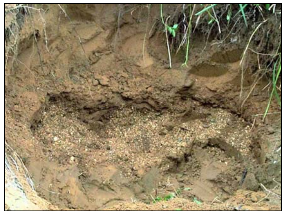
Cowry Midden at the Site Planned for the Outlet of 4th Nuclear Power Plant.

Chapter Chin Emperor in Historic Records stated as follows: Hsu Fu et al. reported the Emperor that