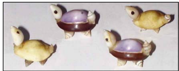
4 shell turtles made of cowry purchased at Yeliu Scenic Spot.

In the “Taiwanese Prehistoric Relics Distribution Map”, the ancestral relics were found in every corner of Taiwan.